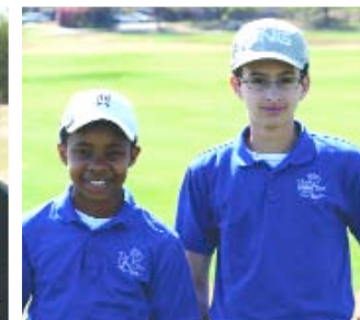
The First Tee participants