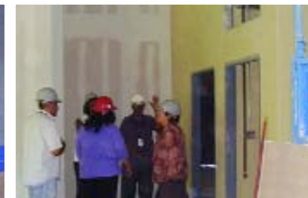
UCC staff viewing one of the new classrooms.