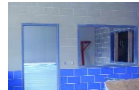
Center Director's Office