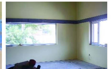
New classroom with large windows looking west and south.